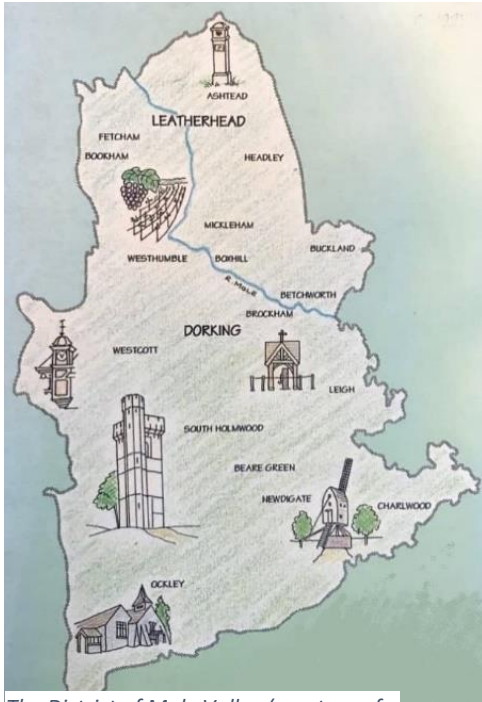
The District of Mole Valley

A Doctor of Laws, after working for over twenty years in corporate as an insurance lawyer, she moved to charity to have more time to care for her child.